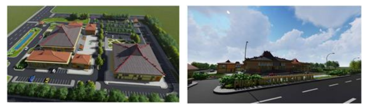
Figure 4. Site Perspective

After the formation of the Land Arrangement, the design of the building is the next design step. The design form is a multi-mass building centered on the gallery building as the main building. On-site facilities include the Gallery Building, Reception Building, Shopping Building, Restaurant Building, Office Building and Musholla Building. Where the overall mass designed has a relationship with the title and theme.