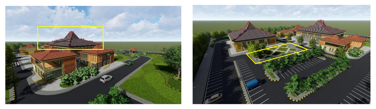
Figure 6. Building Shape and Land-form

The value applied to this building in addition to the pattern (building field) which represents the ornament is a roof that has a cultural philosophy, where the roof of the joglo traditional house is given a modern touch. And it can be seen that the application of the joglo roof is placed on all buildings on the site, thus creating a harmonious and balanced impression. In addition, the application of patterns is also seen in the form of a garden located in the centre of the site, inspired by Javanese batik patterns that can be a point of interset in the land order.