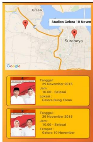
Figure6. Display of Sub Menu about Campaign Schedule

The campaign schedule sub menu can be done by tapping three times in the second menu. In this sub menu, you will be informed about the schedule and location of the campaign from each candidate pair. The system used in the campaign schedule menu is an application from Google, namely the Google Geocoding API and Reverse Geocoding API. Geocoding functions to convert an address obtained from the geographical coordinates into latitude coordinates which can be used to place markers on the map, whereas for reverse geocoding is the opposite of geocoding which is converting coordinates to an address [6]. The appearance of the sub menu about the campaign schedule is presented in figure 6.