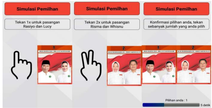
Figure5. Display of Sub Menu About Simulation How to Choose