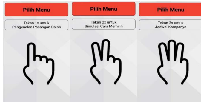
Figure3. Display of the Second Menu for Recognition of Candidate Pairs, Campaign Schedules and Simulation of How to Choose

are the same as the instructions on the first menu. If you want to know the candidate pair then just press once, to learn about the simulation how to choose just tap twice and to find out the campaign schedule by tapping three times. The place to press on the SUARAKU application is not specification, it is used to make it easier for blind people to use this application.