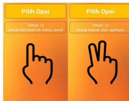
Figure7. Display of third menu