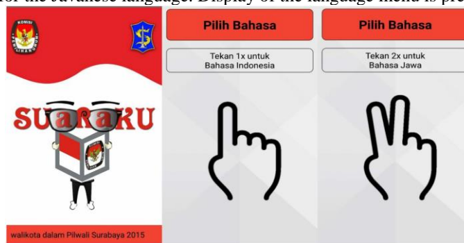
Figure2. Display of Main Menu for Language Selection

The first menu will show about language. The type of language chosen is two, namely Javanese and Indonesian. The choice of language type will be guided by a voice that gives instructions if you want to use Indonesian then just tap once, whereas if you want to choose Javanese just tap twice. As an interface between the user and the application being run, a vibration sensor is used with 5 seconds delay for each selected instruction. While the sound in the SUARAKU application is the result of recording the researchers. The purpose of using the Javanese language in this application is to preserve Surabaya's local culture and help tuna sufferers to more easily understand the election campaign. This language selection will be used until the last menu. If the language menu has been selected in the Indonesian language, then the use of this application will use Indonesian language sounds to completion, and so for the Javanese language. Display of the language menu is presented in figure 2.