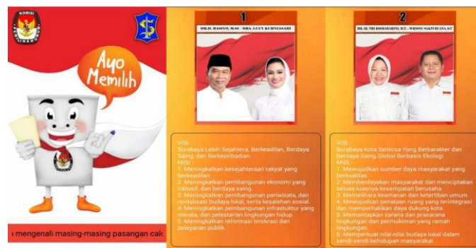
Figure4. Display of Sub Menu About Candidate Pairs

This menu consists of photos of each candidate, the name of each candidate pair and from the vision and mission of each candidate. The instructions used in this menu also use sound, where the voice will explain everything related to each candidate pair. After the explanation about the candidate introduction is complete, then to return to the second sub menu, you can use a tap once, then proceed to use the simulation menu to select by tapping twice. The display of the candidate pair introduction sub menu is presented in figure 4.